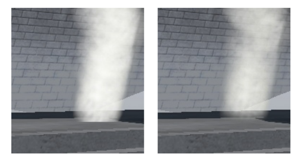
Figure 2: Left: regular particles reveal their 2D nature at intersections with the ground. Right: soft particles fade out coverage near intersections.