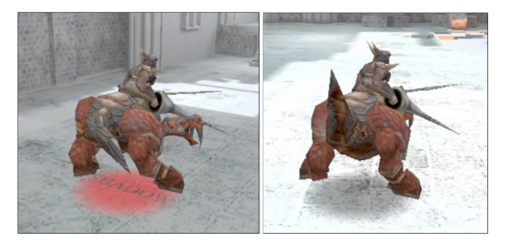
Figure 4: Testing the drop shadow with a temporary texture, and the final result.