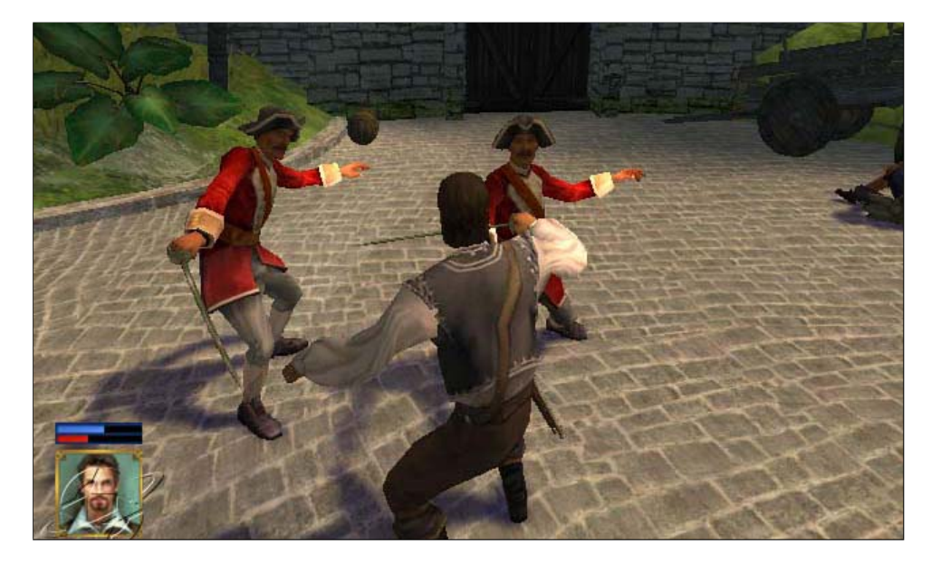
Figure 1: An interactive world with multiple characters, dynamic effects, and an integrated heads-up-display for a GUI.