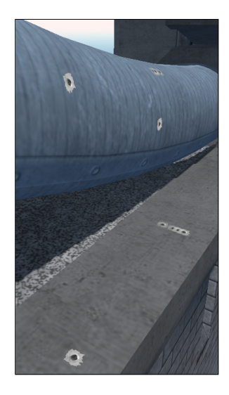
Figure 3: Bullet holes rendered as decals on curved surfaces and geometry with varying orientations.

(a) Add state to the player for health, points, and four tool slots. Three of the tool slots should initially be empty and the first should initially hold the hit-scan laser tool.